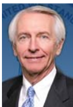
Governor Steve Beshear (Invited)

Director Legacy Center at the Bluegrass Community Foundation