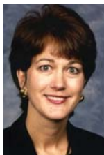
The Honorable Alice Forgy Kerr Kentucky Senate