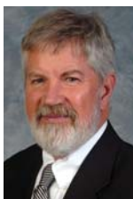
The Honorable Carl Rollins Kentucky House of Representatives