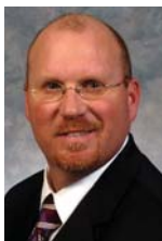
The Honorable Kevin Sinnette Kentucky House of Representatives